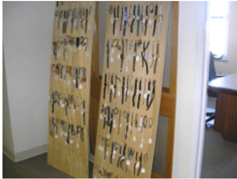
The watch collection thus far.